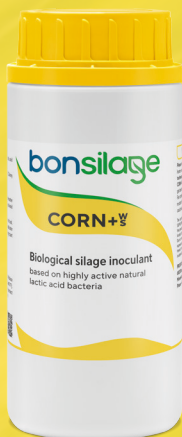
200 G 100 tons FM forage