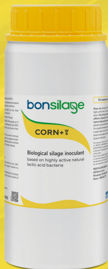
1000 G 500 tons FM forage