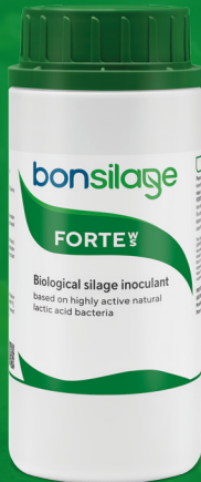
200 G 100 tons FM forage