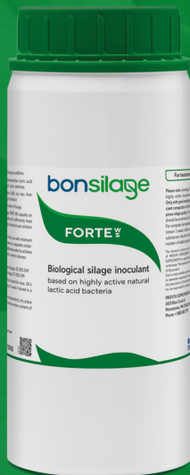
1000 G 500 tons FM forage