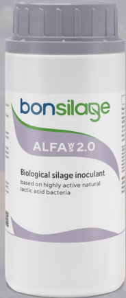
200 G 100 tons FM forage