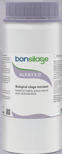
1000 G 500 tons FM forage